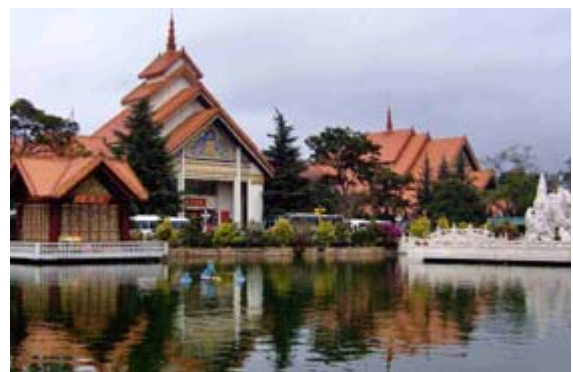
Yunnan Nationalities Vallage