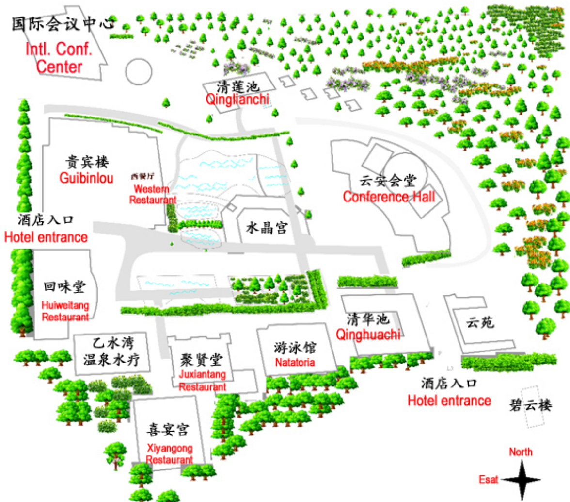
(Map of Kunming Yun'an Huidu Hotel)