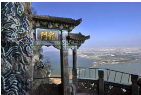
West Hill and Dianchi